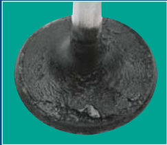
> Carbon build up on valves

Photos show results of testing with & without Flashlube Injector Cleaner.