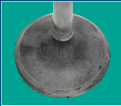
> After treating with Flashlube Injector Cleaner